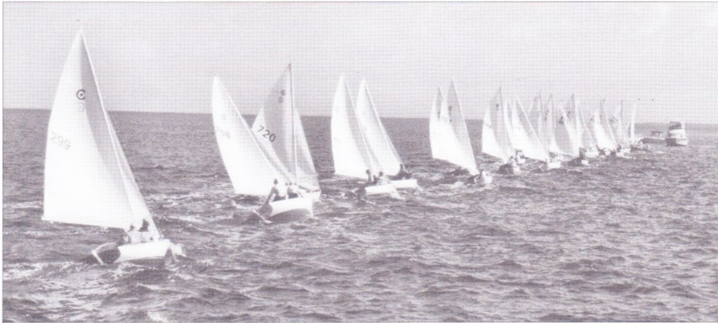
Going down the line waiting for the gun on a glorious day in March at the Bullseye Nationals at Card Sound in 2000.