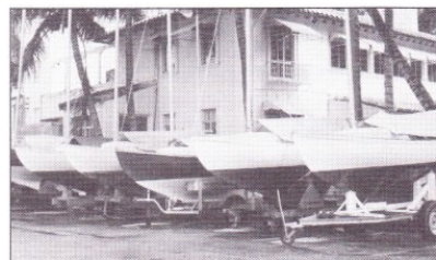
Where and when? Gordy Goodwin found this photo in Cape Cod Shipbuilding's archives. Is this at Key Largo? We don't think so. Send answers to a curious editor.